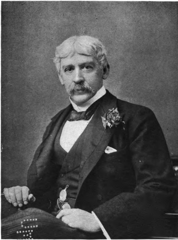
FRANCIS BRET HARTE